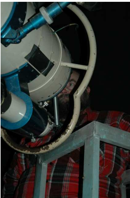
Clif Ashcraft peers through the eyepiece of the 10" scope.