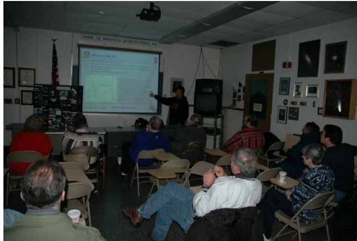
The assembled crowd gathers to discuss repairs to the 10-inch scope.